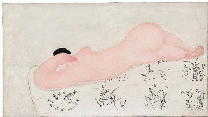
Sanyu, Nu Rose Sur Tissus Chinois 1930s, oil on canvas, 45.2 by 81.2 cm Est. HKD 35,000,000 – 45,000,000 / USD 4,470,000 – 5,740,000

Female nudes were an important theme throughout Sanyu's career; from his arrival in Paris in the 1920s up until his final years in the 1960s, he retained a strong interest in the female body. Nu Rose Sur Tissus Chinois is one of Sanyu's classic works from the 1930s, in which he pays homage to the tradition of classical Western masterpieces, yet in his own distinctive style, with his signature exaggeration and distortion of the body.