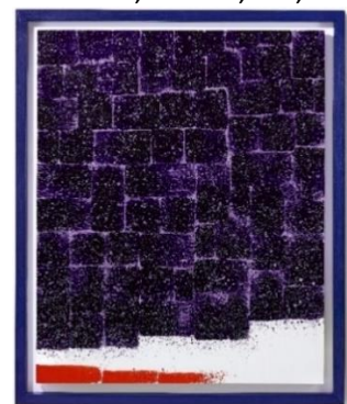
Hsiao Chin, Samadhi-23

Est. HKD 1,200,000 – 2,600,000 / USD 153,000 – 332,000