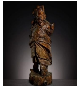
Ju Ming, Guan Gong

Est. HKD 2,000,000 – 4,000,000 / USD 255,000 – 510,000