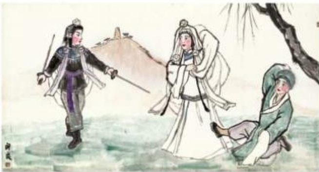
Guan Liang, Legend of The White Snake