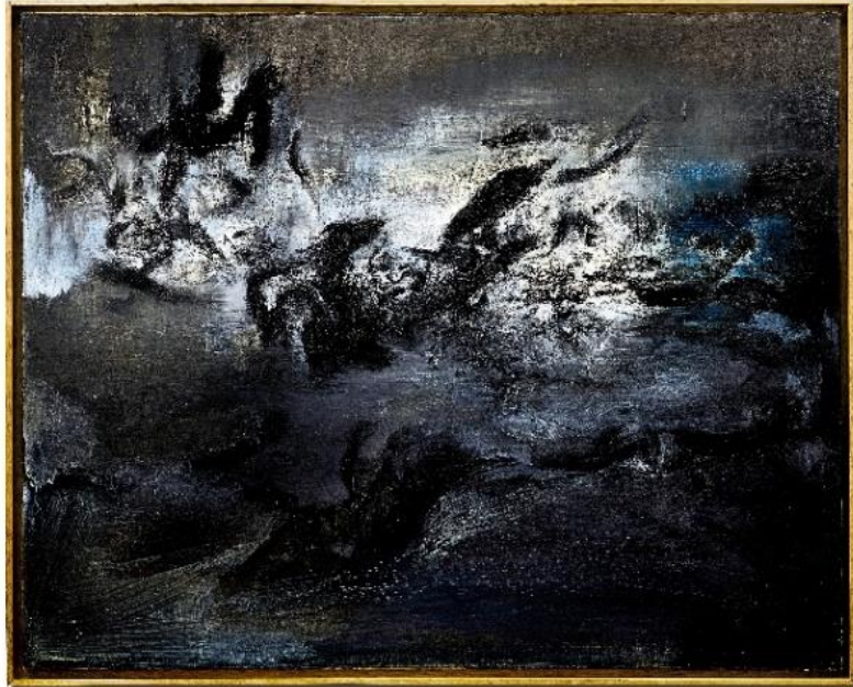
Zao Wou-Ki, 21.04.59

- Both Appearing at Auction for the First Time Ever -