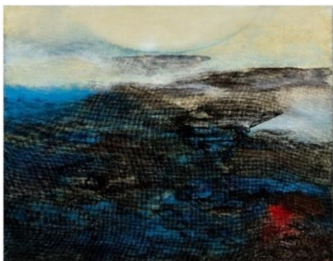
Lalan, Sans titre

Est. HKD 6,000,000 – 8,000,000 / USD 765,000 – 1,020,000