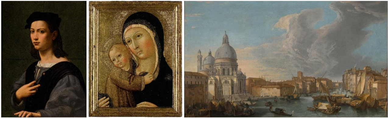
(from left): Giuliano di Piero di Simone Bugiardini, Portrait of a young man ; Sano di Pietro, Madonna and Child ; Luca Carlevarijs, Venice, a view of the Grand Canal with the Church of Santa Maria della Salute