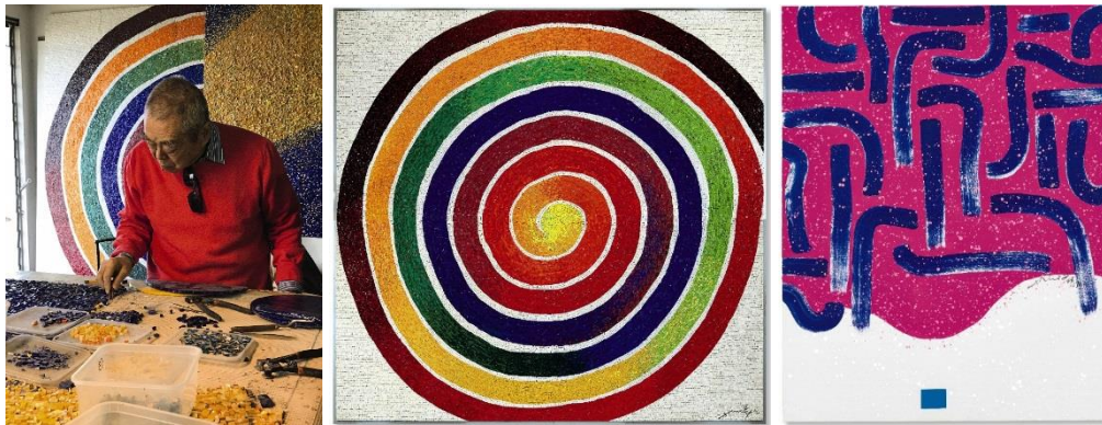
(from left): Hsiao Chin was doing a series of mosaic glass paintings at Studio Reduzzi in Milan, Italy in November 2017; Enormous Cosmic Whirlpool , 1983 – 2014; La danza di Luce -5 , 1963

Sotheby's Hong Kong Gallery, 5/F One Pacific Place, Admiralty