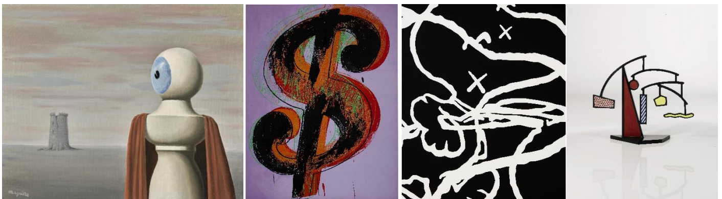
(from left): René Magritte, La belle lurette , 1965; Andy Warhol, Dollar Sign , 1981; KAWS, Untitled (MBFT5) , 2015; Roy Lichtenstein, Mobile I , 1989

Hall 1, Hong Kong Convention and Exhibition Centre